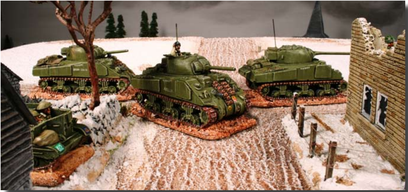
Battle Map: Foy-Notre-Dame (Table size 6' x 5')